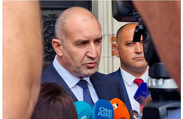
Prime Minister Rumen Radev speaking to the media at the Holy Synod, Sofia, June 26, 2026

Sofia - Prime Minister Rumen Radev told reporters on Friday in response to a question about criticism of the 2026 draft budget , which was published by the Ministry of Finance on Wednesday that the government had consulted leading economists who say there's no way the deficit could drop sharply from 7.5% to 3% in just a few months.