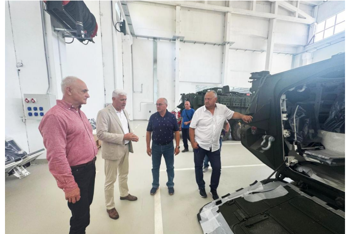
Defence Minister Dimitar Stoyanov visits TEREM-Ivaylo Ltd. in Veliko Tarnovo, North Central Bulgaria, June 26, 2026

Veliko Tarnovo, North Central Bulgaria - Defence Minister Dimitar Stoyanov visited TEREM-Ivaylo Ltd. in Veliko Tarnovo on Friday to inspect progress on the final assembly of Stryker combat vehicles for the Bulgarian Army. The plant is currently assembling five vehicles, which are expected to be completed within the next few months.