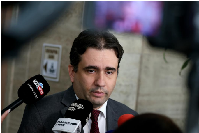
Democratic Bulgaria floor leader Bozhidar Bozhanov speaks to reporters at the National Assembly, Sofia, June 19, 2026

Sofia - A criminal group in Varna (on the Black Sea) used forged notary deeds to seize numerous municipal and state-owned properties, Democratic Bulgaria floor leader Bozhidar Bozhanov told reporters in Parliament on Friday.