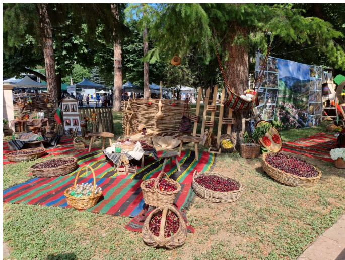
Cherry Festival in Kyustendil in 2025

Kyustendil, Western Bulgaria - Kyustendil's annual Cherry Festival opened on Friday and will run until June 28, featuring a three-day programme of cherry-themed art and culinary exhibitions, the organisers said.