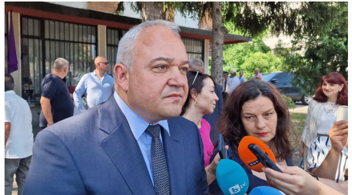
Interior Minister Ivan Demerdzhiev, June 26, 2026

Veliko Tarnovo, Central Bulgaria - A total of 25 people have been arrested so far in a police operation in Varna's Primorski borough, Interior Minister Ivan Demerdzhiev told reporters near Veliko Tarnovo on Friday.