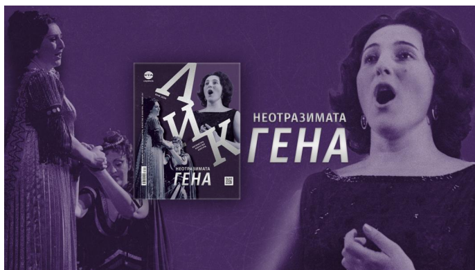
The cover of LIK's June issue, "The Incomparable Ghenia"

Sofia - The June issue of the Bulgarian News Agency's LIK magazine is dedicated to world-renowned opera singer Ghenia Dimitrova (1941-2005). This year marked her 85th birth anniversary on May 6 .