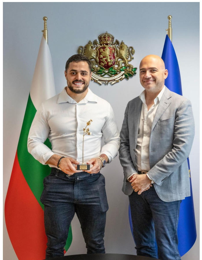
Weightlifter Karlos Nasar (left) and Tourism Minister Ilin Dimitrov

Sofia - Olympic, world, and European weightlifting champion Karlos Nasar has accepted an invitation by Tourism Minister Ilin Dimitrov to take part in a campaign promoting Bulgaria internationally. Along with Eurovision 2026 winner, Dara, he is the next prominent Bulgarian to