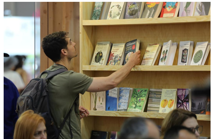
Books by Bulgarian authors showcased at a book festival in Bucharest, June 7, 2026

Sofia - Some 10,267 books and pamphlets were published in Bulgaria in 2025, marking an increase of 1.2% from the previous year, according to a Friday press release of the National Statistical Institute.