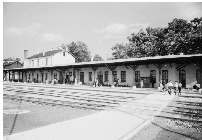
A view of the old railway station in which a Museum of Transport and Communications was inaugurated on the occasion of the 100th anniversary of the start of the Bulgarian State Railways, Ruse, June 26, 1966

Sofia - The National Museum of Transport and Communications - the only one of its kind in this country, was opened in Ruse (North Central Bulgaria, on the